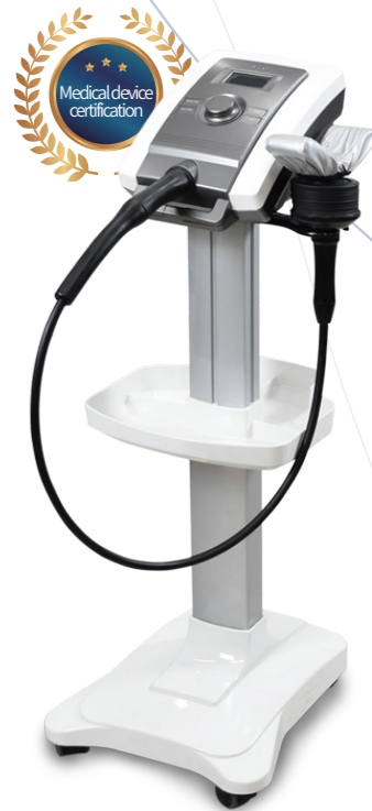
SASO - LU 01M7-L